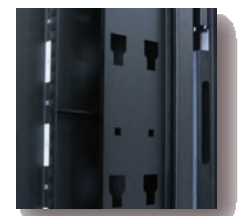
4 Universal Mounting Brackets