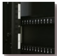
Vertical Position Marks