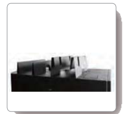
Roof Cable Trough