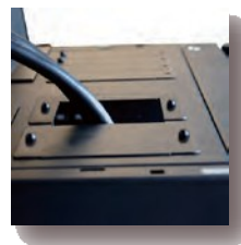
Roof Cable Ports & Covers